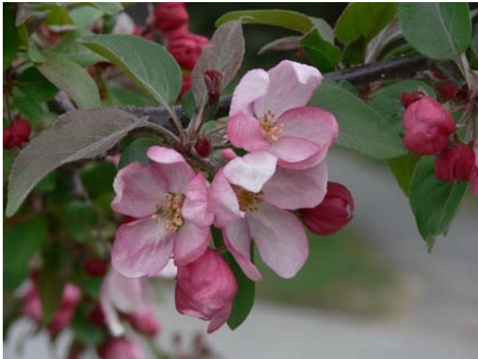
The crabapple trees are thick with blossoms.