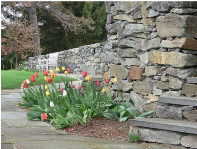
Tulips lean out to greet meditators on the front lawn of the Retreat Center.