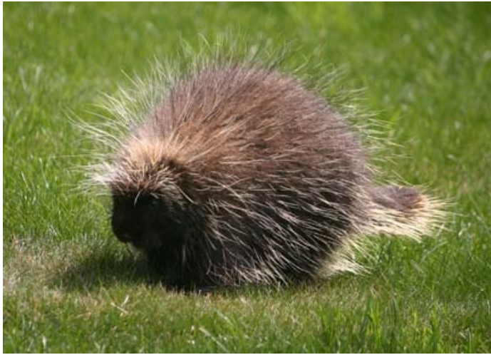
This chubby porcupine has been a recent visitor.