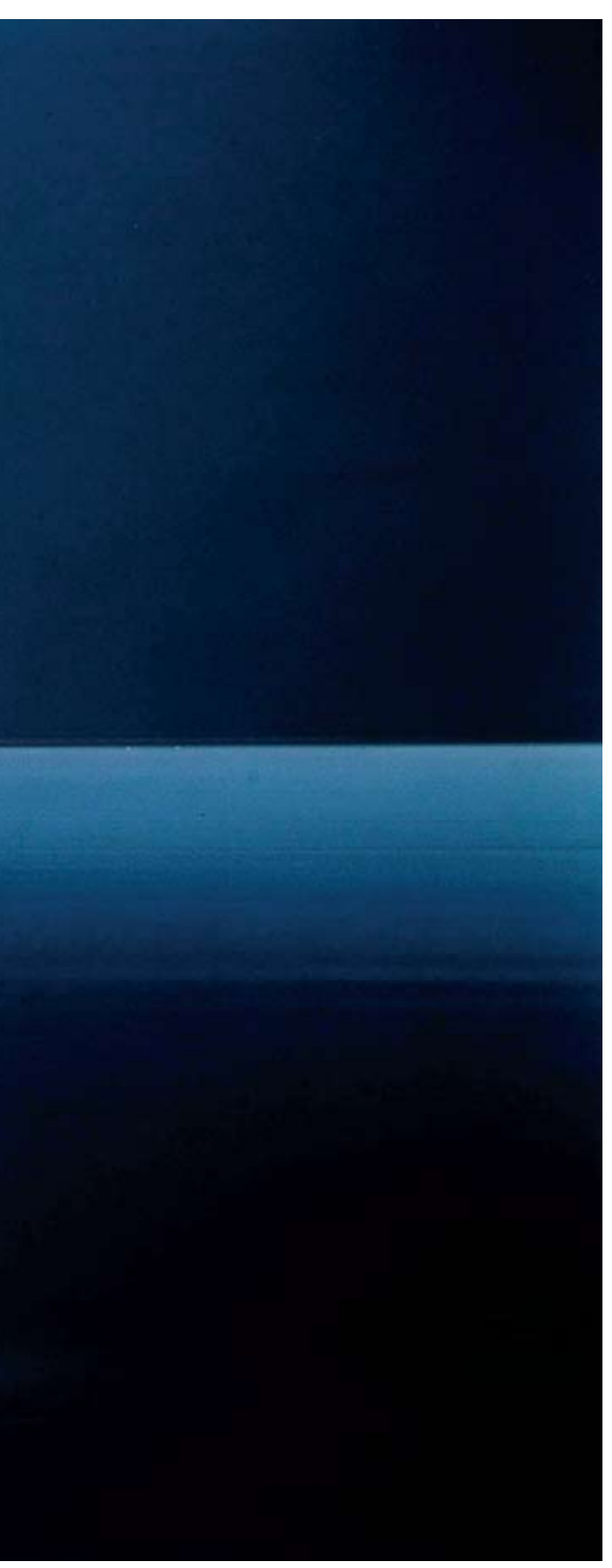
FROM HIGH TIDE WANE MOON, WWW.NAZRAELI.COM